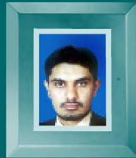
Muhammad Ali BB-1391